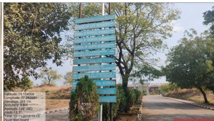
Ramps, lifts, bathrooms, signs and footpaths